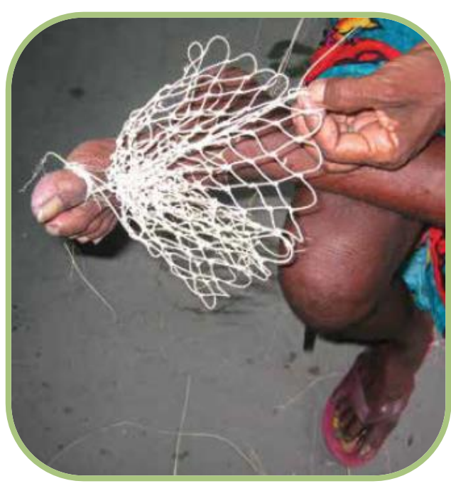
Images in the book describe uses of the different plants. Dillybags are weaved from string made from immature and unopened leaf stems from the Kennedy Palm.