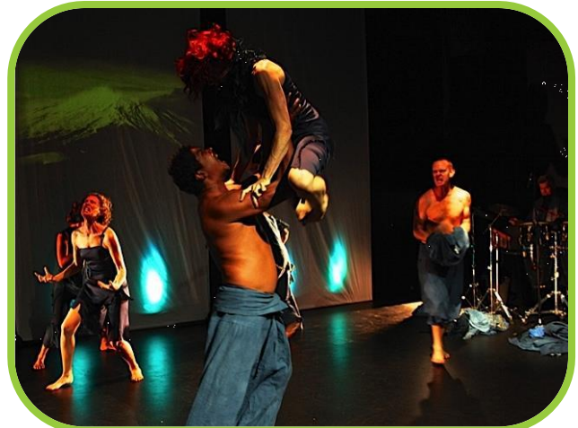
This Fleeting World - Work-in-progress presentation - 16/05/14 - Centre of Contemporary Arts, Cairns.