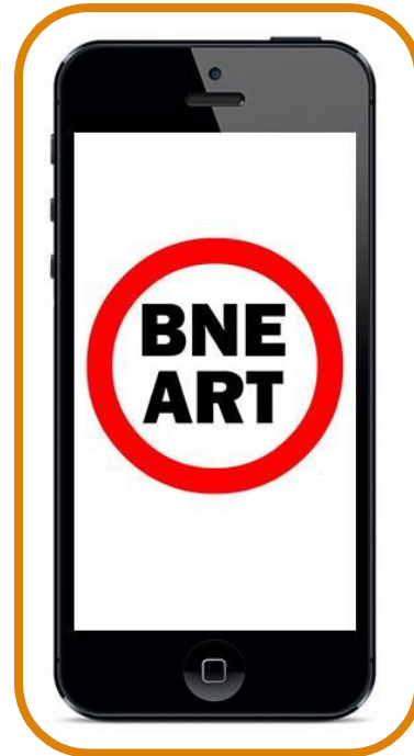
BNE ART Mobile App