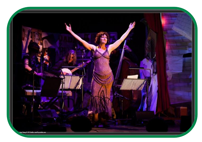
Lighthouse Berlin.